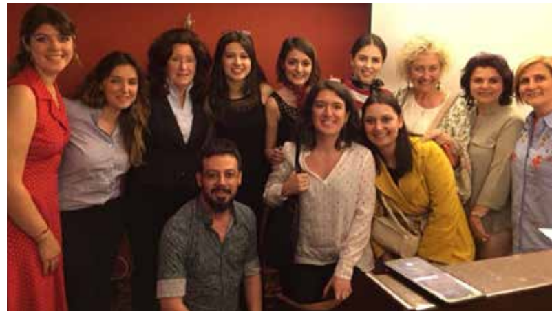
Turkish group in Athens

Swedish, Danish, German, Greek, Italian, Russian, Hebrew, Romanian, Afrikaans, etc. Currently, there are ICEEFT members from 40 countries and ICEEFT-Affiliated Organizations in 15 countries — and the numbers keep growing!