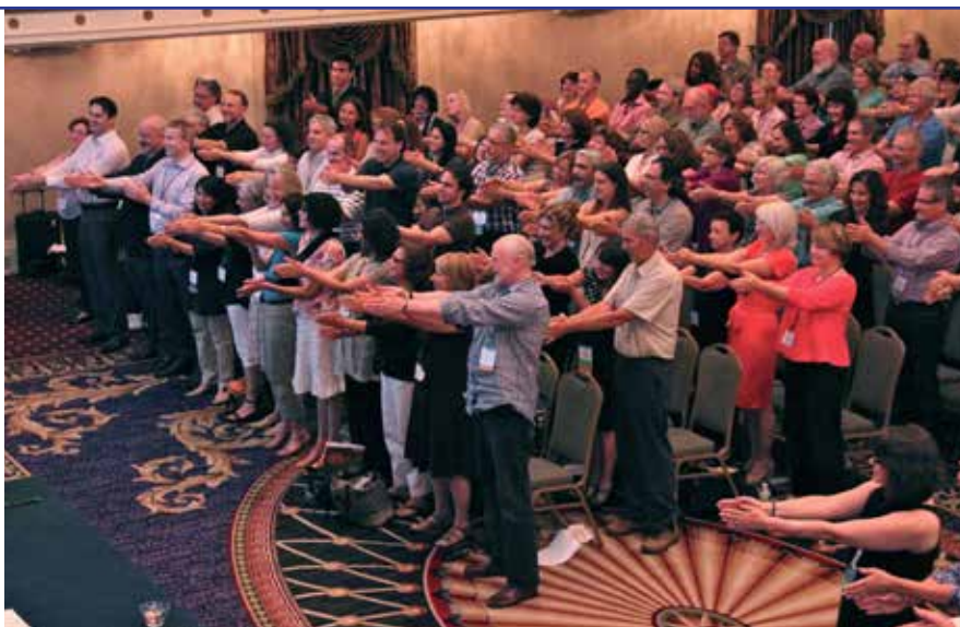
The crowd does the EFT Hand Dance (2012).